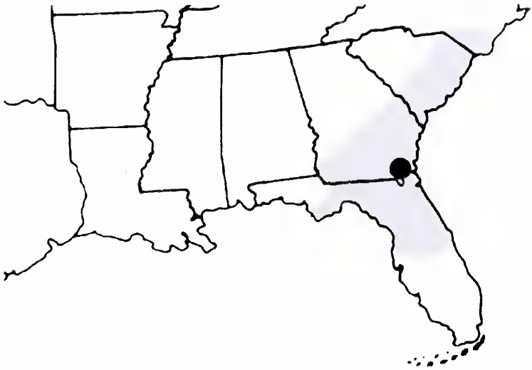
Figure 1: Range map of Sarracenia minor var. minor . The location for Sarracenia minor var. okefenokeensis is indicated by the filled dot.

over var. minor obtained from drier habitat. Still, he concluded that they were ecophenes.